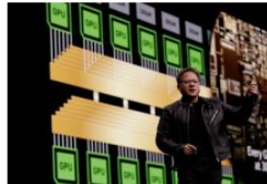
New Nvidia 'supercomputer' could reduce data centre footprint