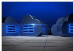
Windows Server to support hybrid cloud and hyper-converged data centres