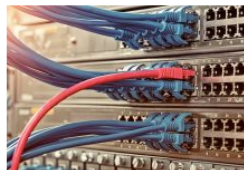
Supermicro launches 25 Gigabit Ethernet server and storage solutions