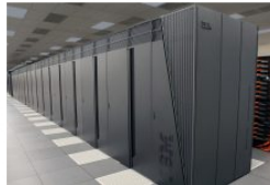
Outdated IT systems holding back enterprise, says new report