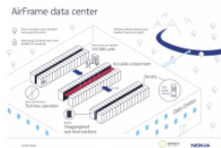
Nokia unveils new 5G-ready data centre