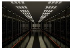
Server market growing fast as big tech companies compete in the cloud